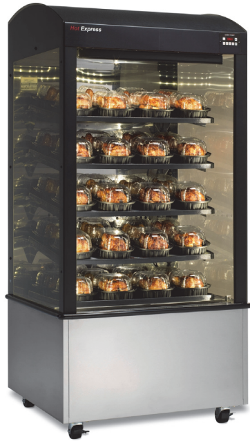
EPC 301 express profit center tall profile 3-ft unit on available casters

Henny Penny express profit centers present an excellent solution for retailers seeking to expand hot food impulse sales and cross-merchandising opportunities.