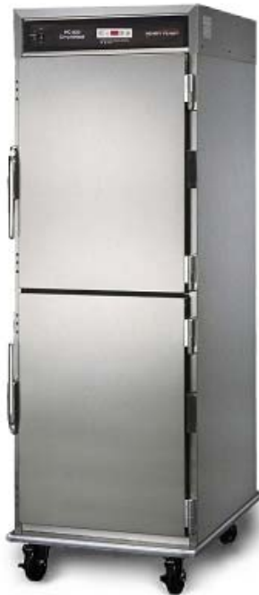
Heated Holding Cabinet Model HHC-900 with SimpleHold controls, dual doors and 5 in. (127 mm) casters. Holds up to 13 full-size sheet pans.