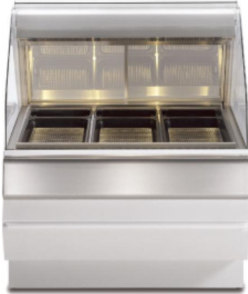
3-well heated merchandiser, model HMR-103 shown as full-serve unit.