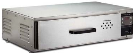
MP 941 modular countertop heated holding cabinet 1 drawer

Modular countertop MP 941 1-drawer MP 942 2-drawer MP 943 3-drawer MP 944 4-drawer