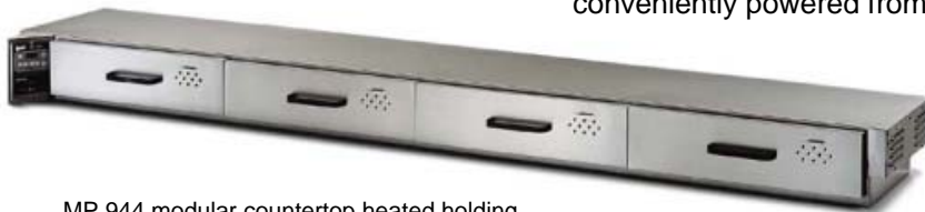
MP 944 modular countertop heated holding cabinet 4 drawer

Control panel features easy-to-read LED temperature display and built-in digital clock.