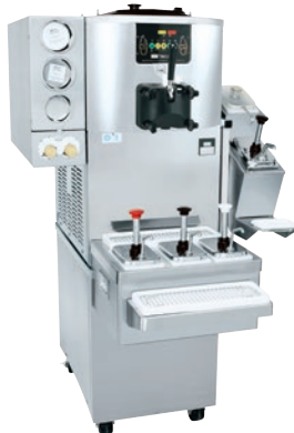
Optional Cart with rear door for front mount syrup rail