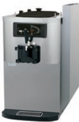
Optional Top Air Discharge Chute