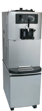
Optional Cart with front opening door